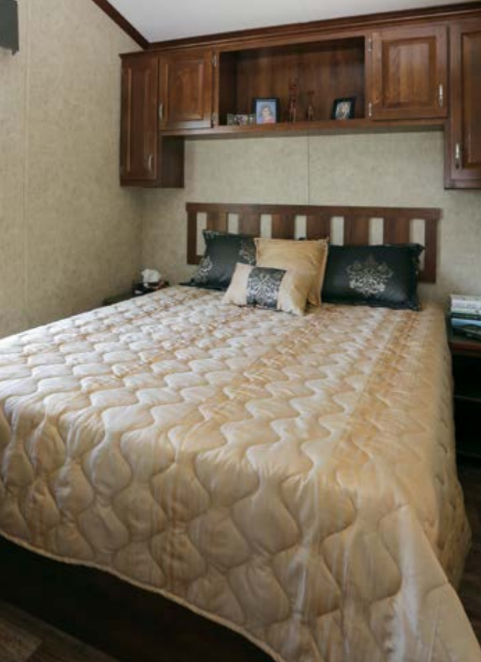
FAIRBANK F3612 1BR FL