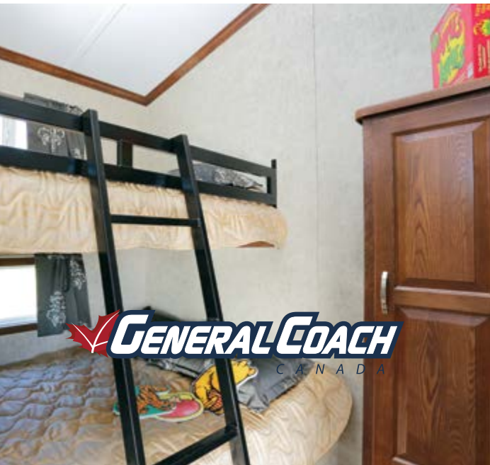
FONTHILL F3614 2BR CK